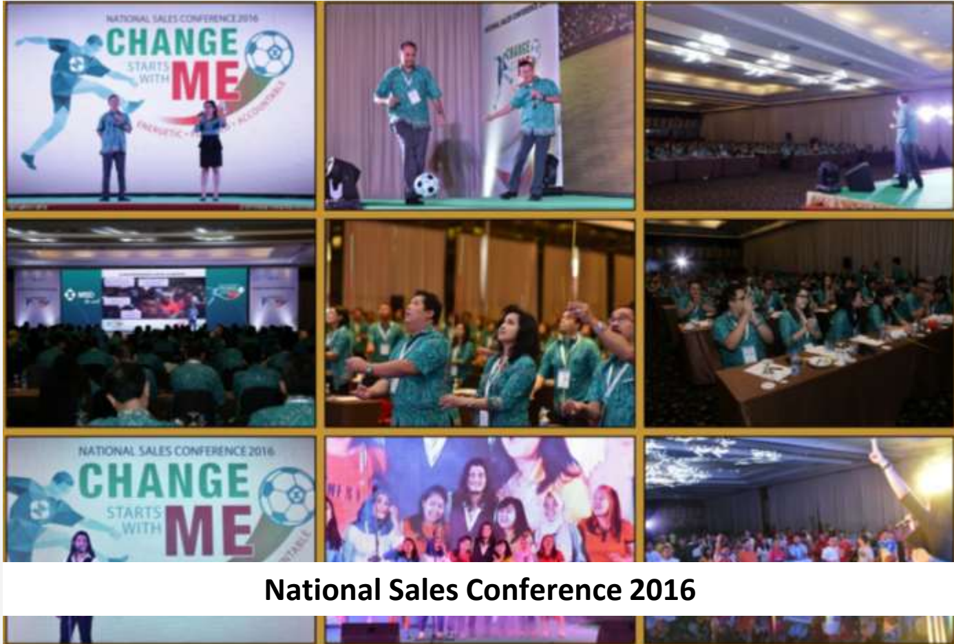
National Sales Conference 2016