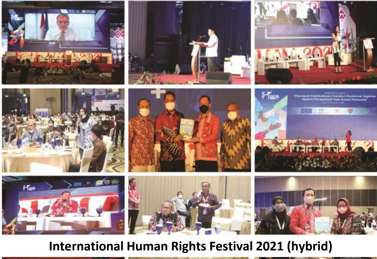
International Human Rights Festival 2021 (hybrid)