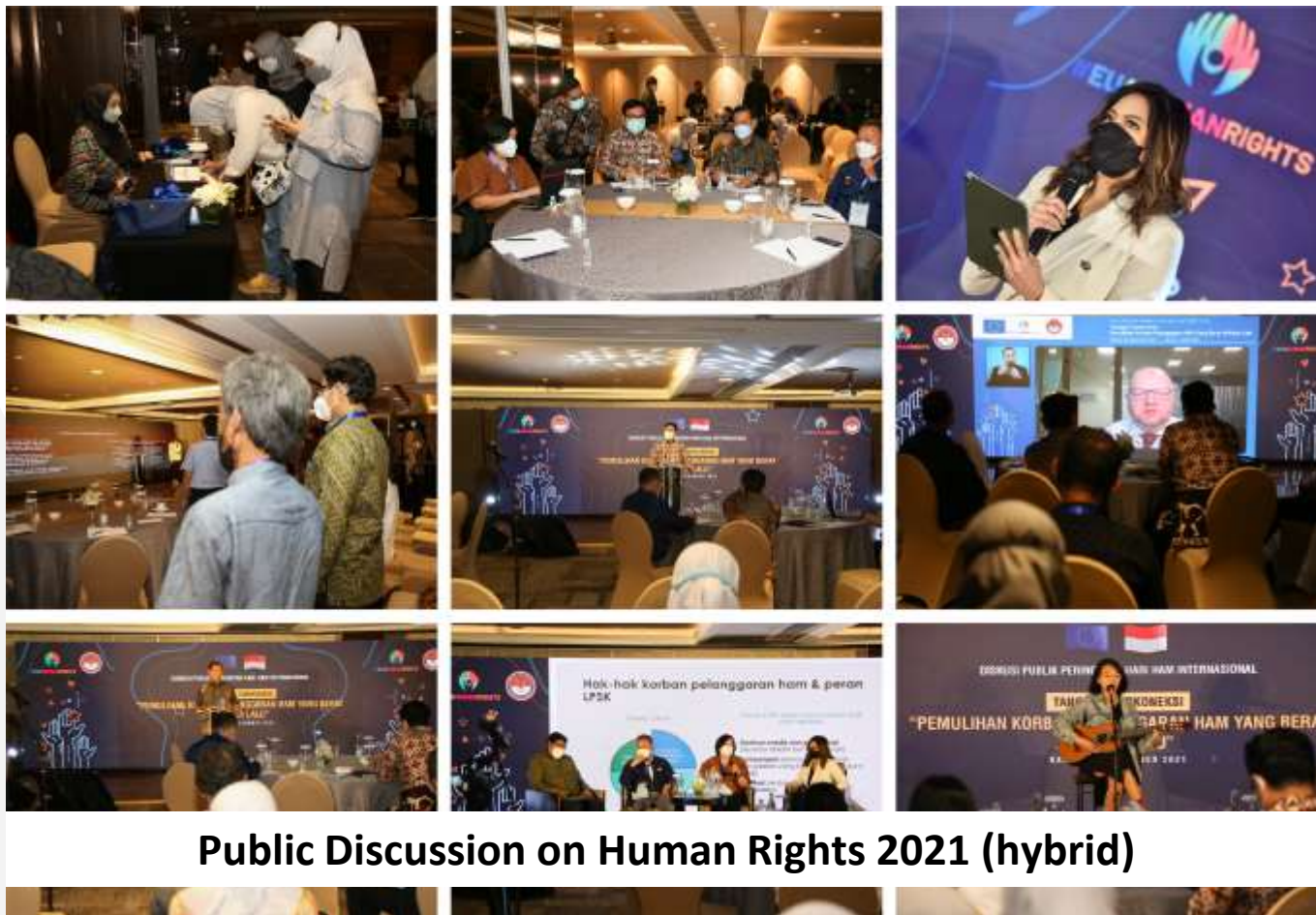
Public Discussion on Human Rights 2021 (hybrid)