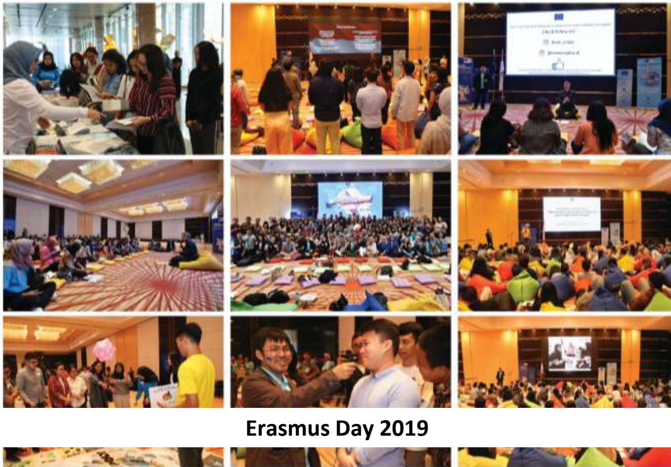
Erasmus Day 2019