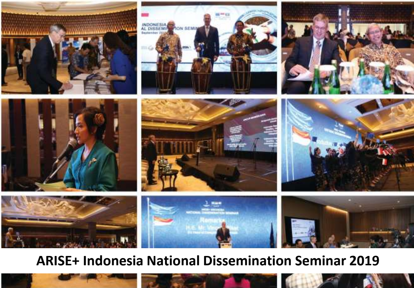
ARISE+ Indonesia National Dissemination Seminar 2019